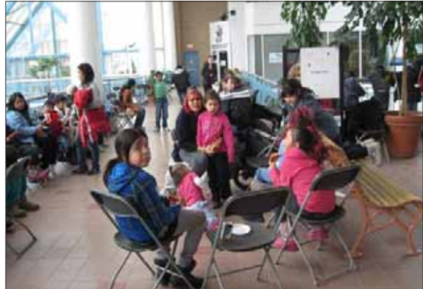
Annual FASTWORKS event at IMAX in March, 2011.

Community Development is funded by United Way Winnipeg and the Winnipeg Foundation.