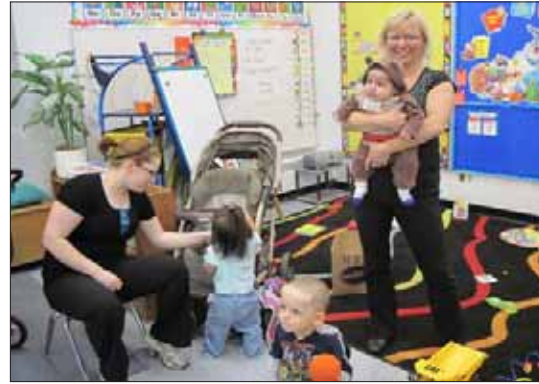
Families and Schools Together volunteers at David Livingstone School F&ST Kids Time.