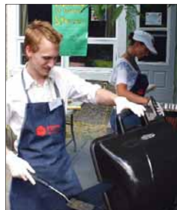
Volunteer at St. Anne’s Family Resource Centre Day of Caring family B-B-Q in Summer, 2010.

Many thanks to the Workers’ Compensation Board of Manitoba for the Day of Caring at Woodydell Family Resource Centre, and to the University of Manitoba for their Day of Caring at St. Anne’s Family Resource Centre in summer, 2010.