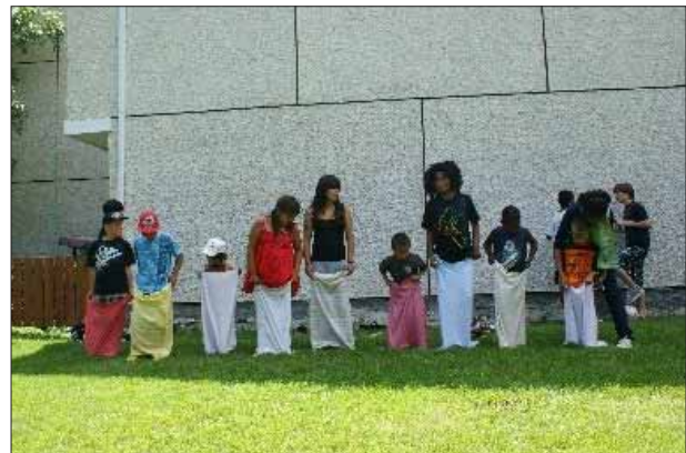
Family B-B-Q at St. Anne's Family Resource Centre.

Every summer The Family Centre of Winnipeg hires students to run kids day camps. In 2010, two of the six students hired were from the St. Anne's housing development and another three were hired from other resource centre communities. The students gained work and leadership experience while planning and implementing a fun filled summer of programming for 6 to 12 year olds. These students proved to be wonderful role models and mentors for the younger children in their communities. Thank you to Manitoba Urban Green Team for supporting this program.