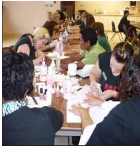
Manicures at Support Worker Appreciation Day, September, 2010.

Newly hired support workers receive comprehensive orientation and ongoing training throughout their first year of employment. In addition, regular training sessions and support groups are scheduled for experienced staff in recognition of the challenging and often isolating nature of their work. These well attended sessions provide meaningful opportunities for new learning as well as time for workers to collaborate and learn from one another. A Support Worker Appreciation Day takes place every fall, providing an opportunity to celebrate the invaluable contributions of these front line workers.