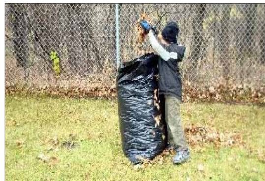
Young volunteer at St. Anne's Family Resource Centre fall clean up.